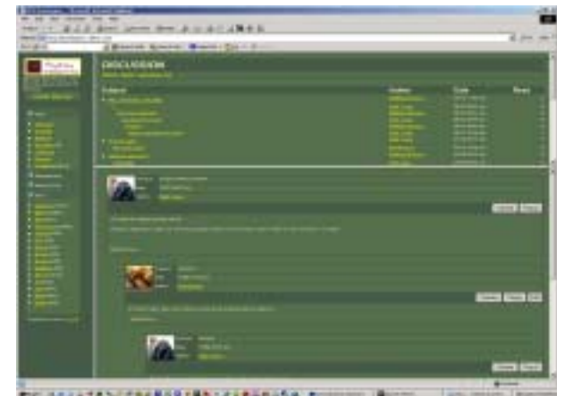
Screen Capture of DayKeep DiscussionTool