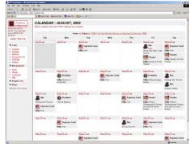
Screen Capture of DayKeep Calendar Tool

CUSTOMIZABLE: Different users access data in different ways. DayKeep is built on a highly customizable interface, allowing individual user's to determine their user preferences and save them. When a user logs on to DayKeep, that user's familiar preferences and groups greet them - no matter where on the globe they are logging on from and no matter what computer station they are at.